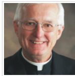
Priests team up for pastoral ministry