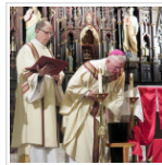
Chrism Mass promotes unity