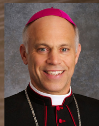
Archbishop Salvatore Cordileone