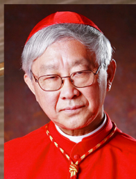
Cardinal Joseph Zen