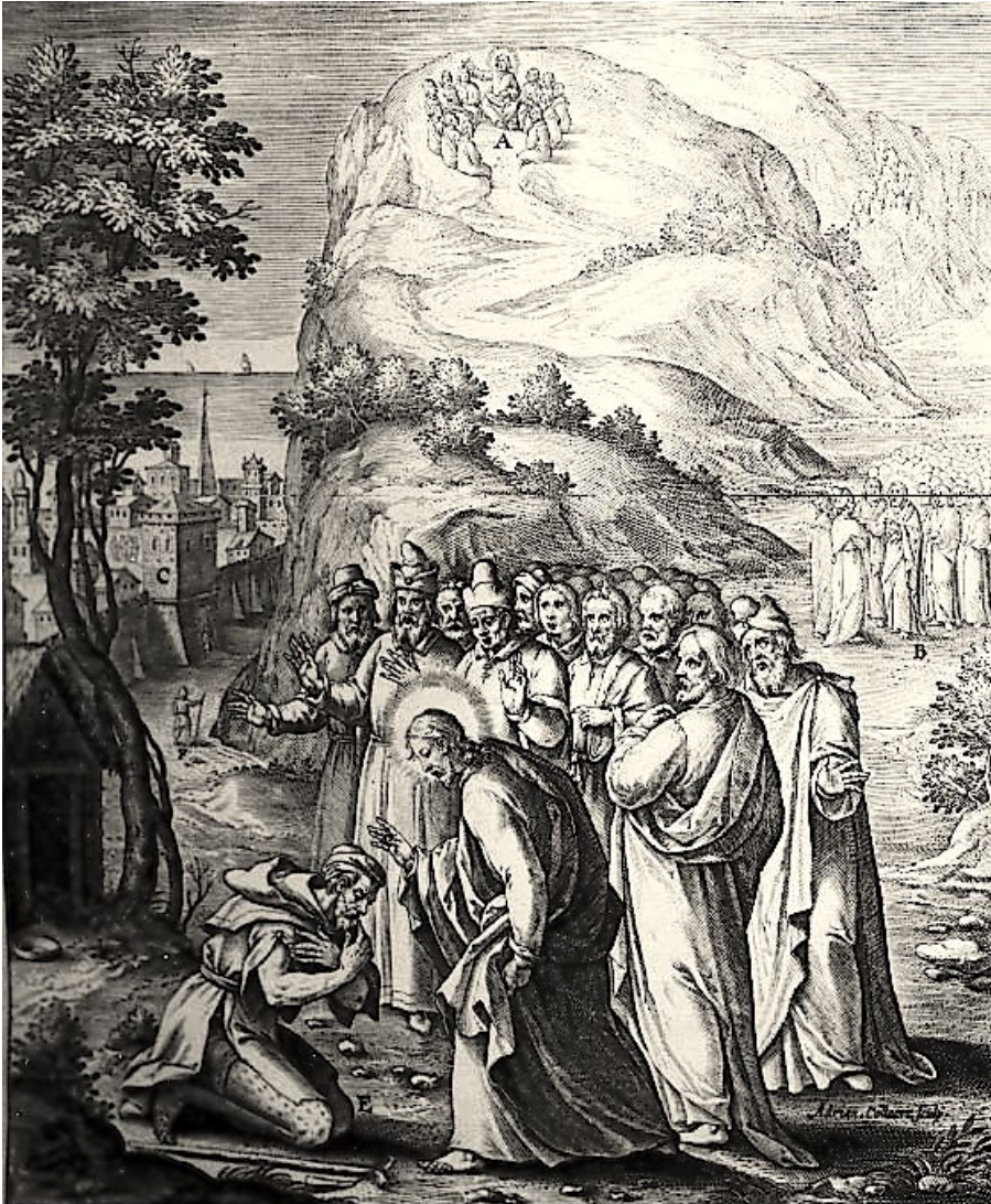
WOODCUT IMAGE - FR. JEROME NADAL SJ - 1595

ST. VITUS CATHOLIC CHURCH - 607 4TH STREET SAN FERNANDO CA 91340