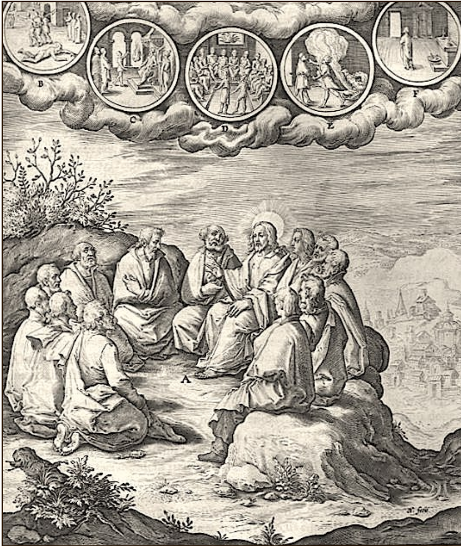
WOODCUT IMAGE - FR. JEROME NADAL SJ - 1595

ST. VITUS CATHOLIC CHURCH - 607 4TH STREET SAN FERNANDO CA 91340