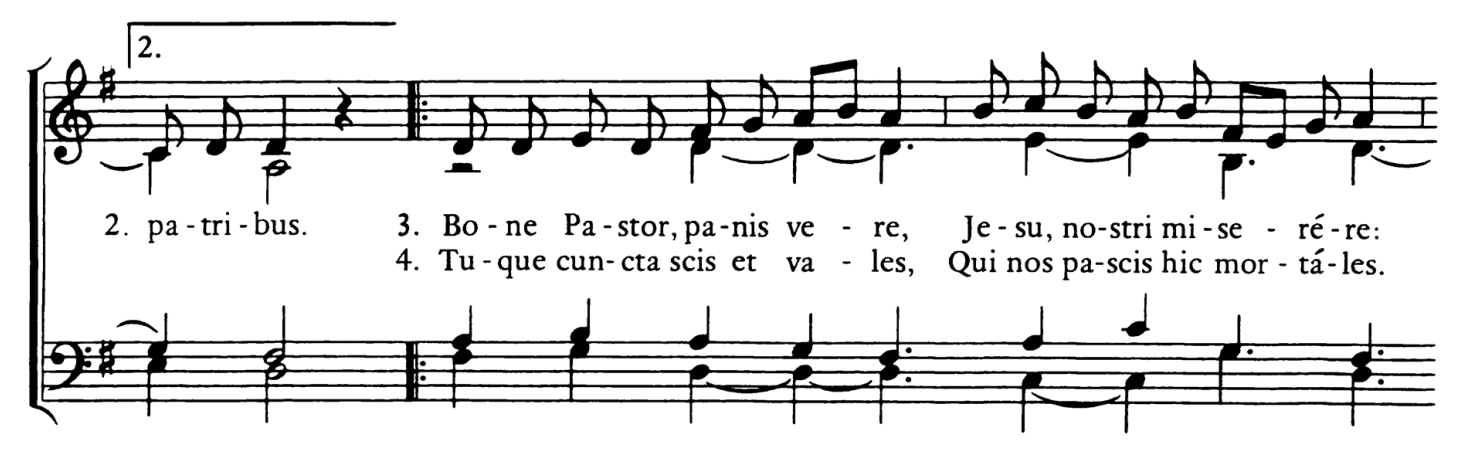
Good Shepherd and true bread, Jesus, have mercy on us; You know all things and can do all things, you feed us in this life.

Thousands of Gregorian chant scores, videos, and more await you: ccwatershed.org