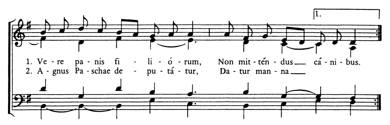
Truly it is the bread of sons and not to be cast to dogs. When a lamb was designated for the Pasch, when manna was given to the fathers (Jews of old).