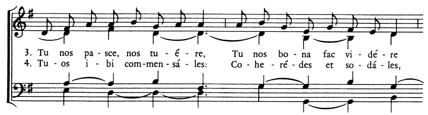
Feed us, guard us, grant us to find happiness Make us your guests there (in heaven), co-heirs and companions