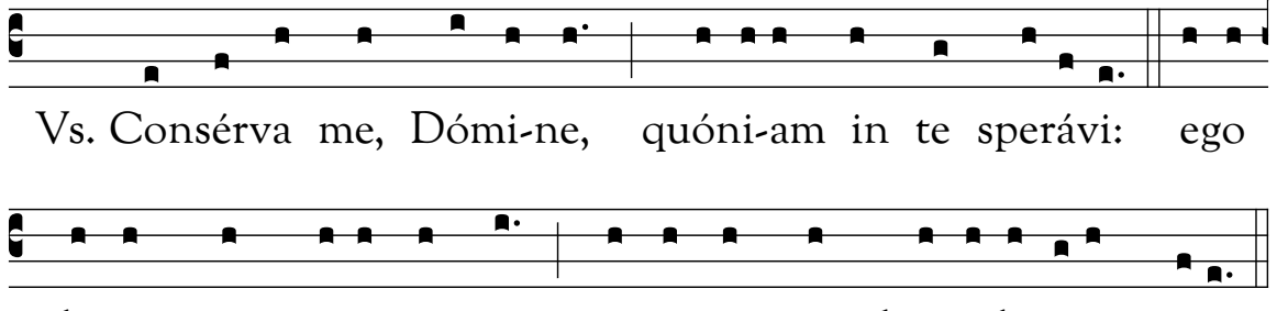
di-xi: Deus me-us es tu: Dómi-nus pars haeredi-tátis meae.

(Ps 15: 1b, 2a, 5a) Vs. Preserve me, O Lord, for I have put my trust in thee: I have said to the Lord: thou art my God: the Lord is the portion of my inheritance.