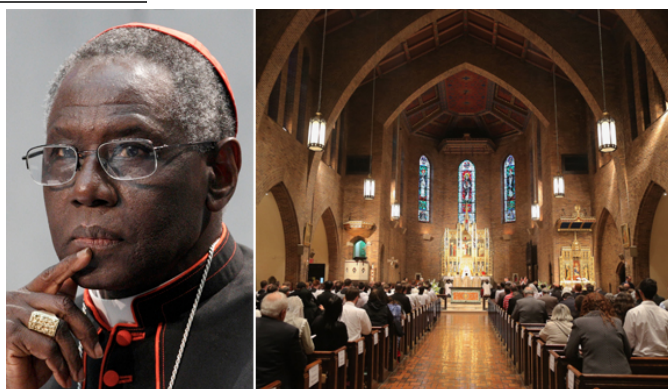
Left: Cardinal Robert Sarah, Prefect of the Congregation for Divine Worship and the Discipline of the Sacraments, in 2011 photo ; right: Photo from Sacra Liturgia 2015, New York City.