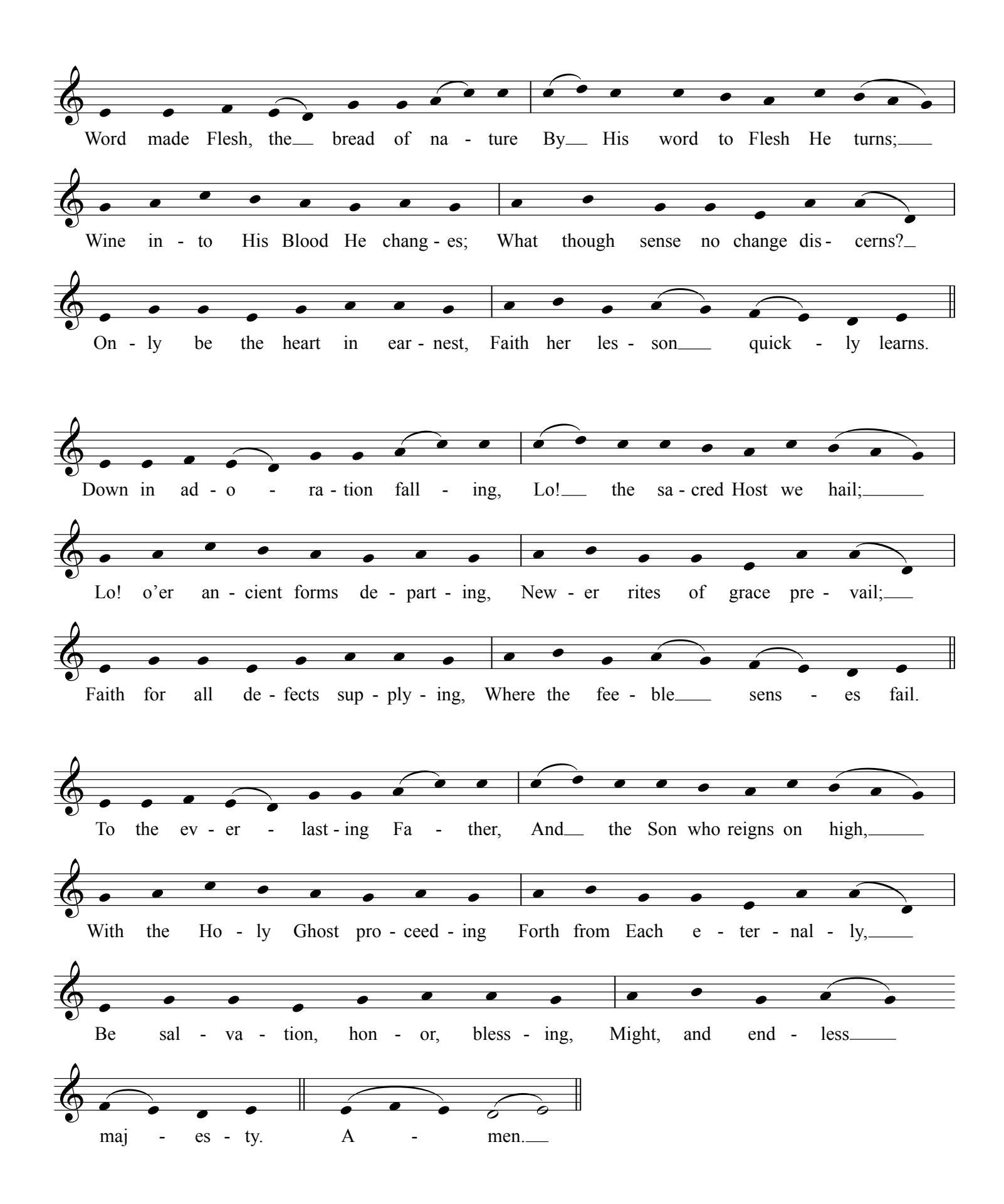
Thousands of Gregorian chant scores, videos, and more await you: ccwatershed.org